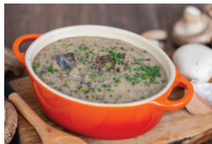
The Soup Spoon

Valid for dine-in and takeaway. Souperholic points cannot be accumulated or redeemed.